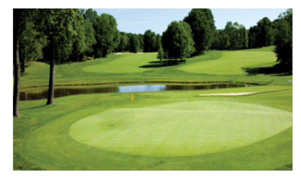
NATIONAL HABOR enjoy shopping, dining and recreational activities