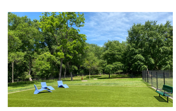
FORT WASHINGTON PARK enjoy a trail walk and learn history

13551 Fort Washington Rd, Fort Washington, MD 20744